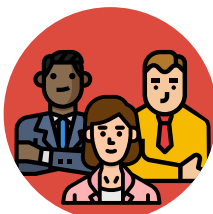
C-Suite / Owners

Essential coordination and education are required for: