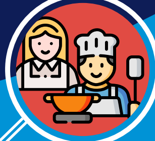
Facility Staff (including housekeeping, guest services)