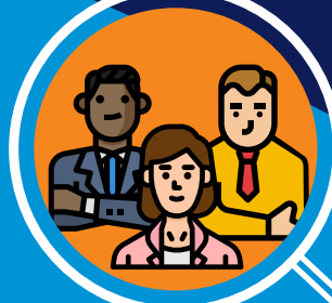
C-Suite / Owners

Consult the EPA recommended list of disinfectants .